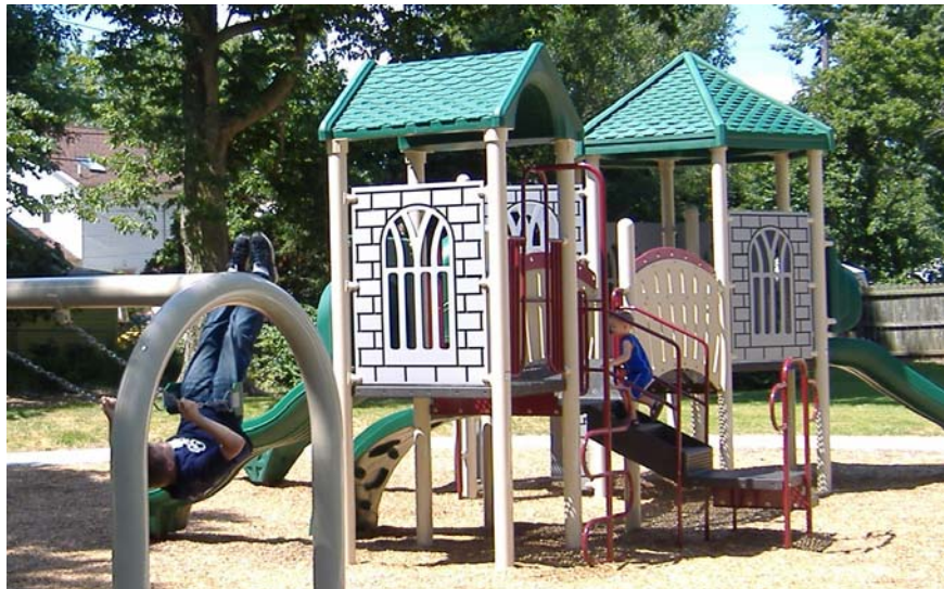
Children playing on the new equipment, Lincoln Street Park.