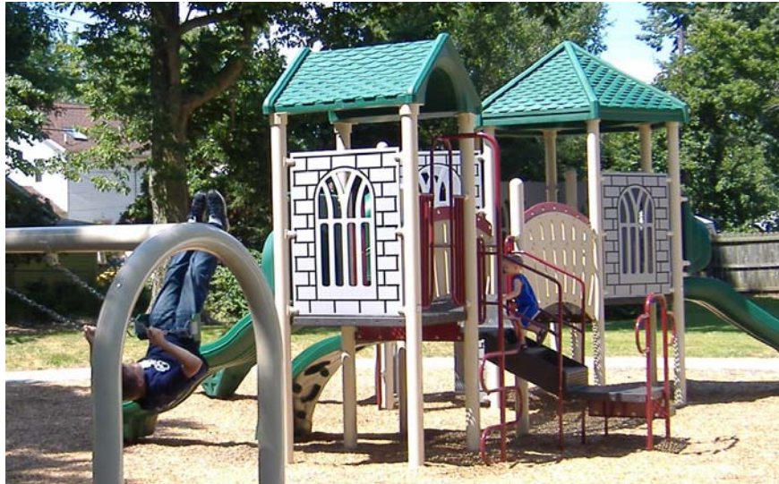
Children playing on the new equipment, Lincoln Street Park.